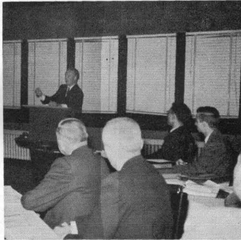
SATURDAY NIGHT CLUB

upon arrival, I have heard one of these make the statement that he loses that tired and weary feeling as soon as this profitable meeting begins. The reader may gather from this article that we of the Sunday night Spokesman's club take great delight and satisfaction in being privileged to attend. The truth of the matter is that we consider time well spent and that there is nothing remotely comparable to the multitudinous benefits and rich rewards one receives from continual, whole-hearted participation.